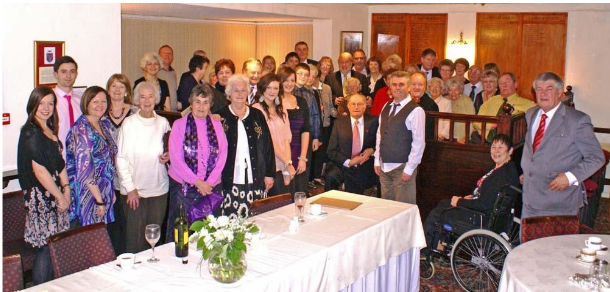
Celebratory Dinner at Aberdare Golf Club

– another event in the 150 th Anniversary Celebrations of Highland Place Church