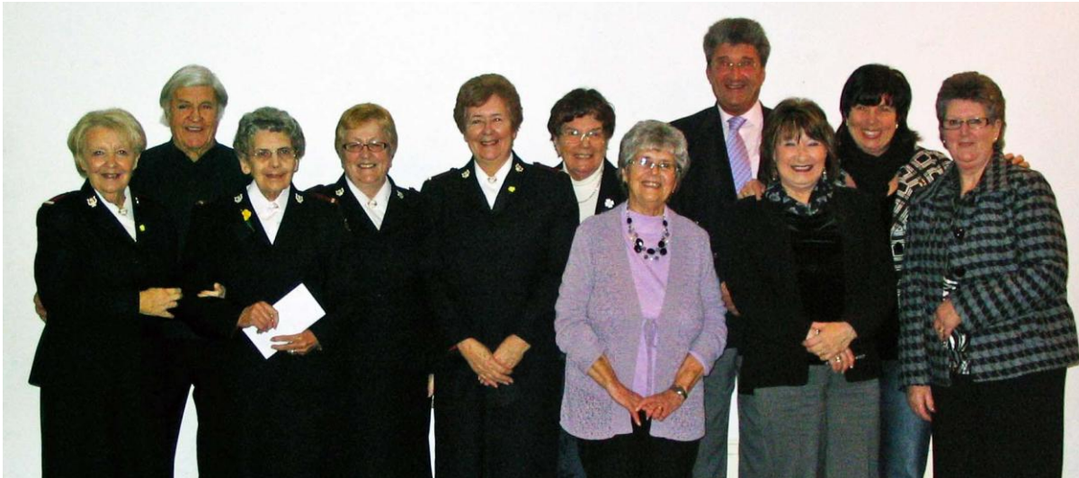
Charity Cash Handover

On Thursday evening, 3 rd February 2011, four members travelled to Aberdare Golf Club to join Highland Place congregation and friends celebrating their 150 th anniversary. Inside the club all was warm and cosy. We enjoyed good food and friendly companionship. Lord Dafydd Elis Thomas spoke in Welsh and I was not very successful with the headphones so I did not get the full benefit of his address, but the second speaker Roy Noble was a joy to listen to. His theme 'we had come together to celebrate our diversity' was well chosen. He stated that 'Life was a patchwork where every human being has worth'. His rich quality of voice, good command of language and a nice sprinkling of humour combined with the confidence of experience made for very enjoyable listening. On leaving the club we were nearly blown over by strong winds and driving rain. Whilst travelling through the dark, we passed rows of houses looking safe and cosy with lighted windows and drawn curtains. I thought of the joy of having a home as a sanctuary. Then I tried to imagine people on such a night looking for a doorway and a cardboard box to sleep in. The misery of it was almost beyond my imagination. Since then, Japan has been devastated by an earthquake and a tsunami when thousands of homes have been washed away – what a sad spectacle, what suffering!